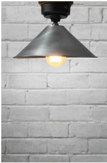
Cone Ceiling Light