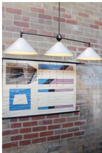
3 Light Pendant - Cone