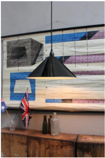
Cone Pendant Light