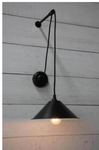
Cone Pulley Wall Light