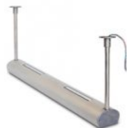
HM600 Customised in an HUQ825E assembly