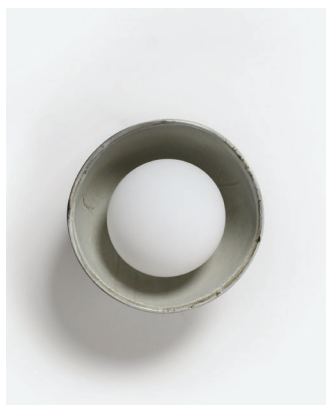
225719 SALT BUSH