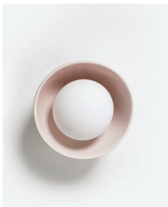
225703 ROSE QUARTZ